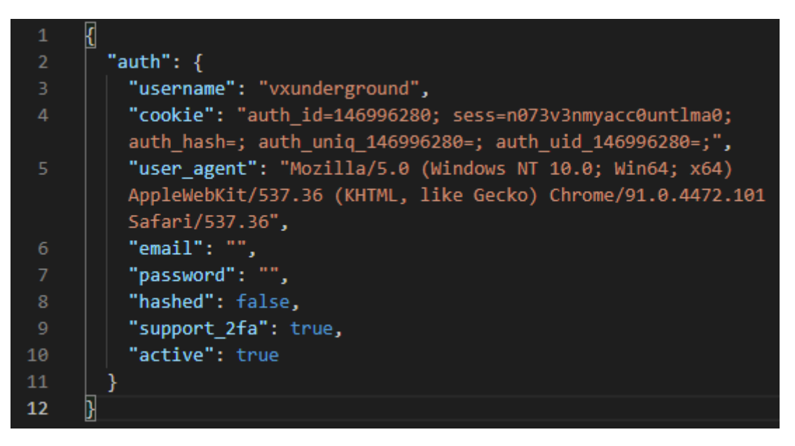
Example of a properly configured auth.json file.

Here is an example of a properly configured auth.json file.